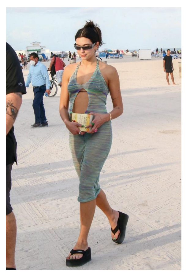
Dua Lipa/Nylon mag

Celebrities like Dua Lipa have been spotted participating in this spicy summer trend.