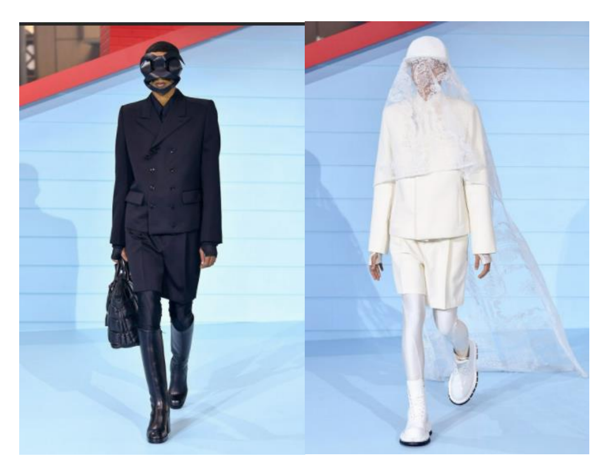
All black outfit, leather boots, and Batman-like headwear.

The brand's final send-off of Virgil Abloh was monumental and paid a beautiful tribute to the late designer.